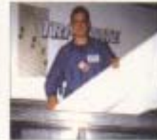
Ultrasonic Blind Cleaning