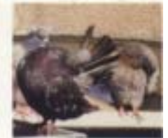
Bird Spikes & Netting

"I have used Tri-State for pressure washing and window cleaning services. They have thoroughly competent crews who work in a timely and extremely professional manner."