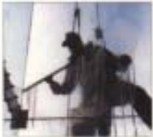
Window Cleaning Restoration