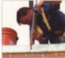
Caulking Masonry Repair/Painting