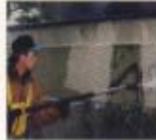
Façade Cleaning Power Washing