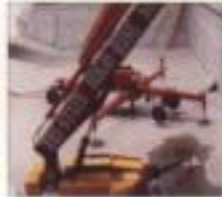
Denka Lift Rental